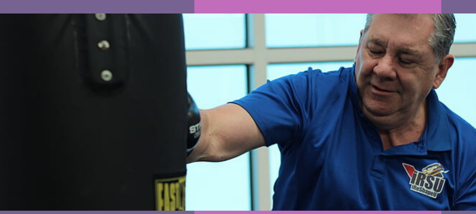
A man in older age punching a heavy bag

We will try to make our organisation as inclusive, diverse and accessible as possible, in line with the IABA Diversity and Inclusion Policy.